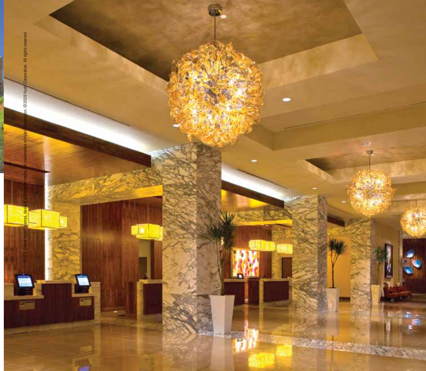
HYATT, Grand Hyatt®, names, designs and related marks are trademarks of Hyatt Corporation. © 2009 Hyatt Corporation. All rights reserved.

A MARVEL OF MODERN DESIGN. AN EQUALLY STUNNING LOCATION.