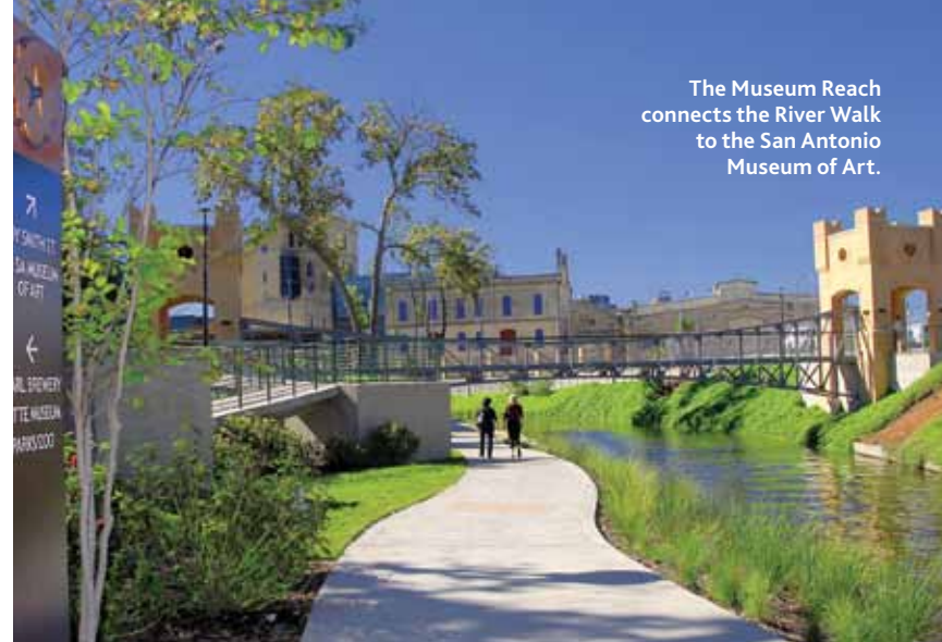
The Museum Reach connects the River Walk to the San Antonio Museum of Art.

In the Stone Oak area, where new upscale neighborhoods and shopping centers abound, locals gather at stylish restaurants like Brasserie