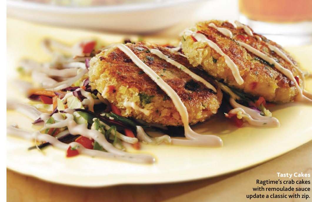
Tasty Cakes Ragtime's crab cakes with remoulade sauce update a classic with zip.

Water, water everywhere and great seafood to eat