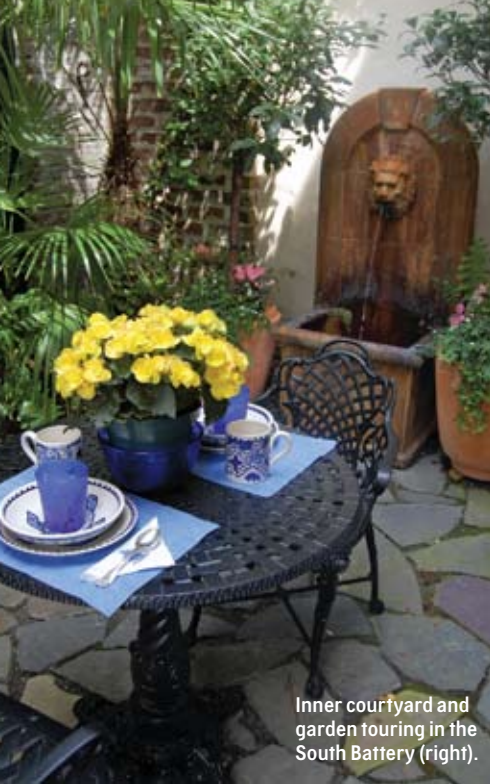
Inner courtyard and garden touring in the South Battery (right).