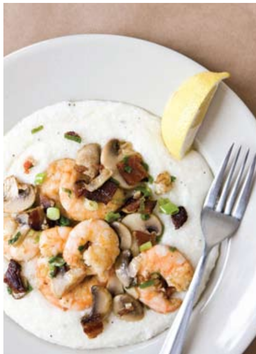
Belt It Out! (Clockwise) The Gospel at Colonus at Spoleto Festival USA, East Bay Street, and shrimp and grits at Hominy Grill.