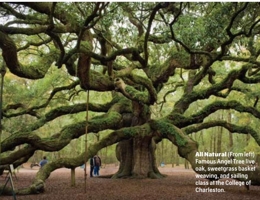
All Natural (From left) Famous Angel Tree live oak, sweetgrass basket weaving, and sailing class at the College of Charleston.