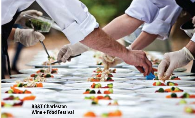
BB&T Charleston Wine + Food Festival