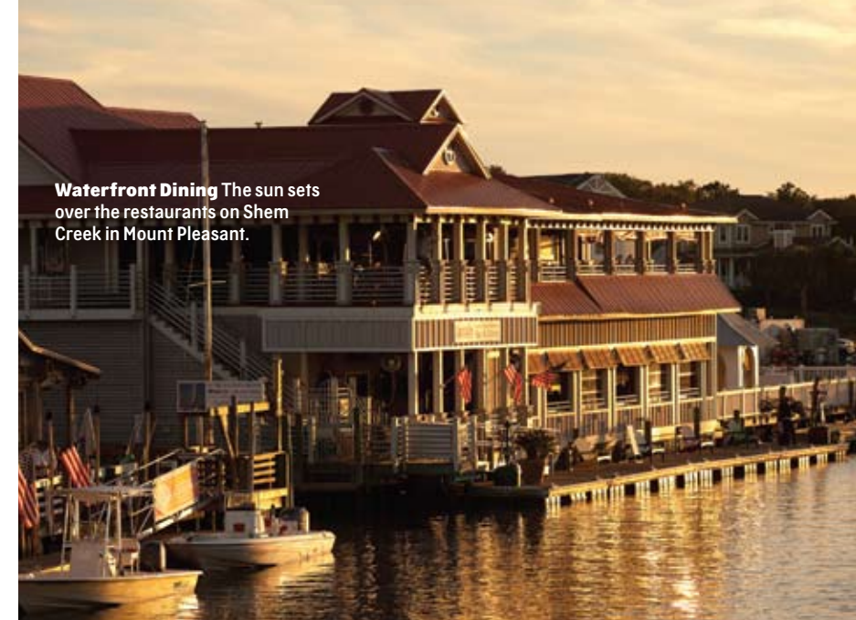
Waterfront Dining The sun sets over the restaurants on Shem Creek in Mount Pleasant.

The Charleston Area CVB just bolstered the family experience by starting the Charleston Explorers Club ( charlestonfamilyfun.com ). To join, children pick up “passport” books at area visitor centers, and earn “stamps” when they visit historic plantations, the aircraft carrier at Patriots Point, the Center for Birds of Prey in Awendaw, downtown museums on Museum Mile, and other attractions. Back at home, kids log passport codes online and earn