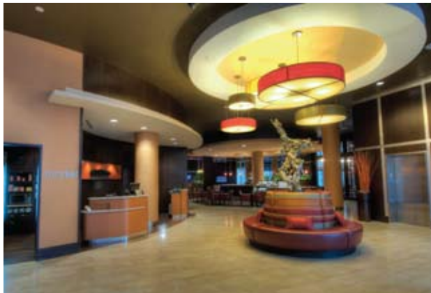
Clockwise from left: Courtyard by Marriott Greenville Downtown, The Red Horse Inn, The Westin Poinsett, The Bleckley Inn