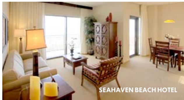
SEAHAVEN BEACH HOTEL

sweet treats, and movie night in the expansive amphitheater.