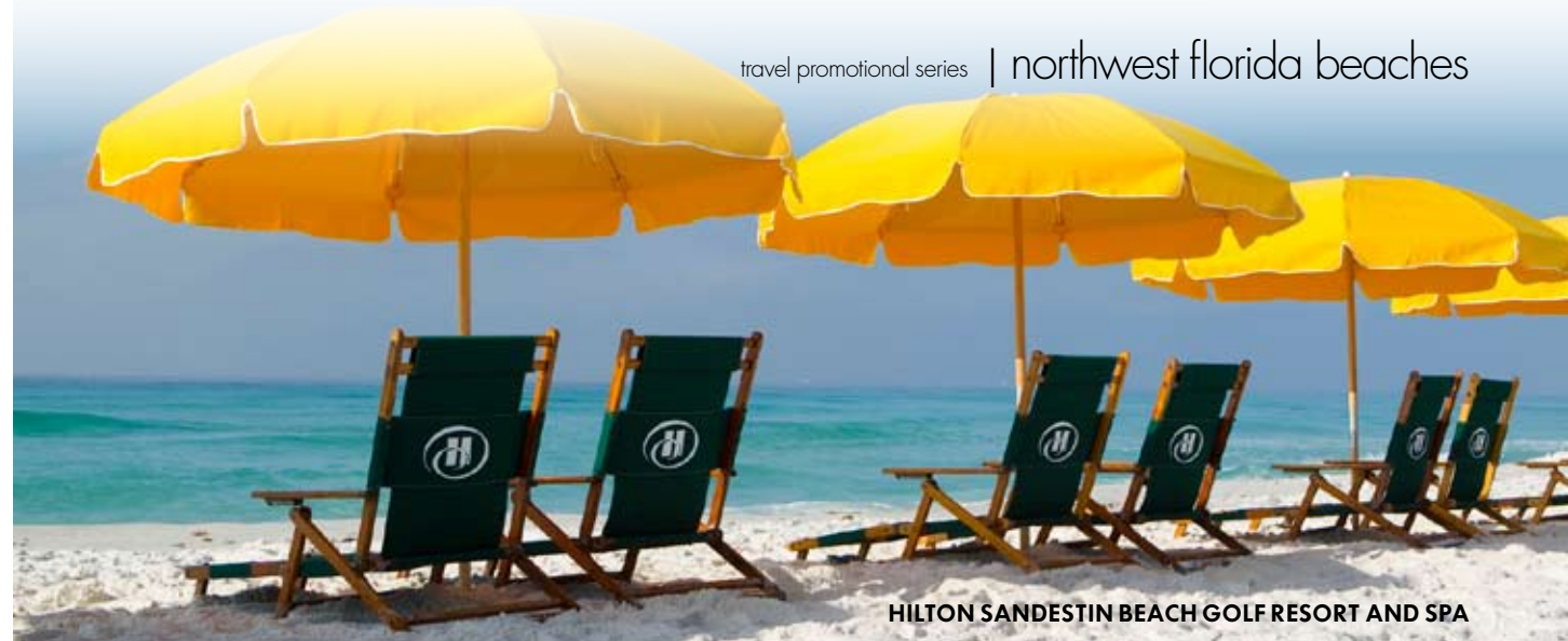
HILTON SANDESTIN BEACH GOLF RESORT AND SPA

recently initiated a new, comprehensive branding campaign, "Visit South Walton," with "Find Your Perfect Beach" as the promising tag line.