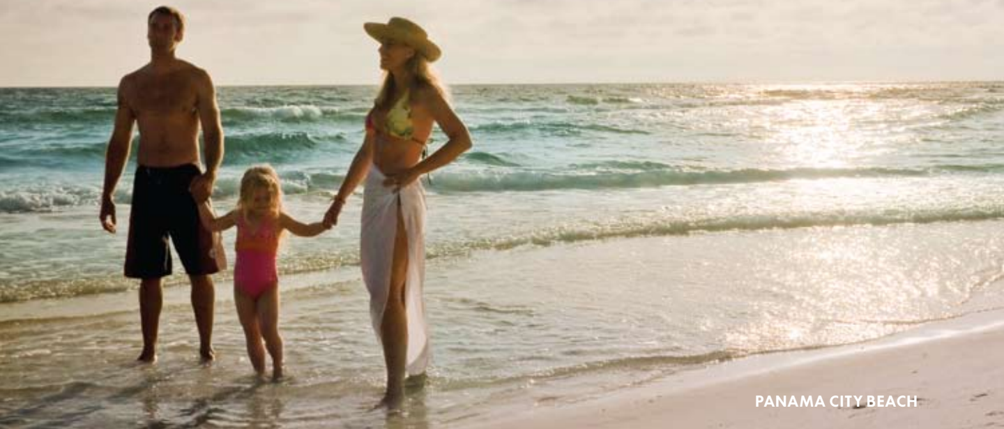
PANAMA CITY BEACH