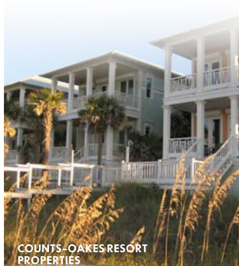
COUNTS-OAKES RESORT PROPERTIES