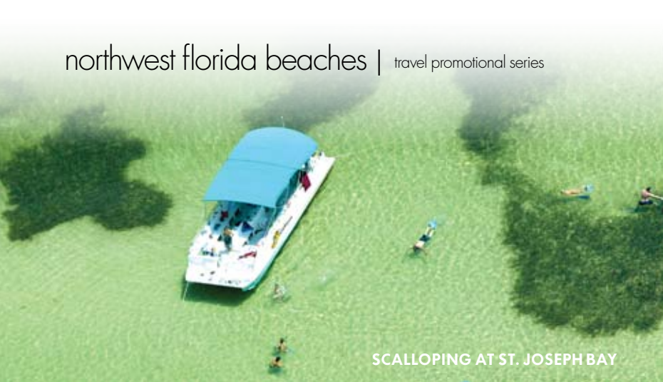
SCALLOPING AT ST. JOSEPH BAY