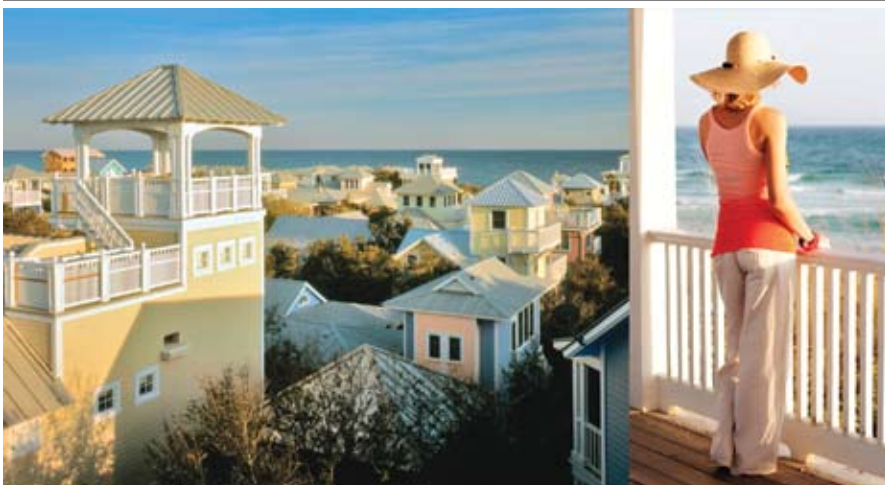
SEASIDE® acclaimed by Frommer's , CondéNast and Travel+Leisure Magazine