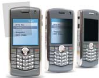
3M Mobile Privacy Films darken side views on your cell phone so others can't see what you are texting or emailing.