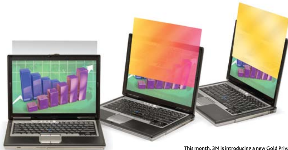
This month, 3M is introducing a new Gold Privacy Filter.