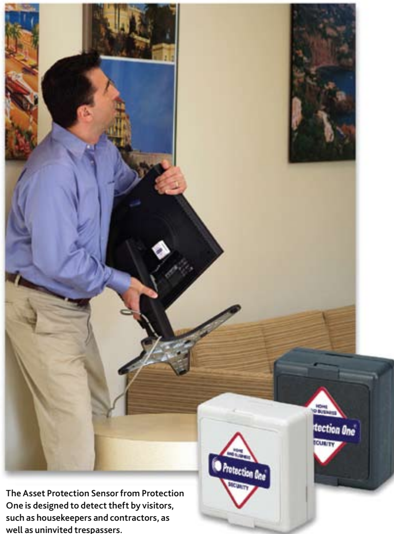
The Asset Protection Sensor from Protection One is designed to detect theft by visitors, such as housekeepers and contractors, as well as uninvited trespassers.

Foil ID thieves by routinely shredding (by hand if necessary) all bills, ticket stubs and bank statements on the spot, and then dispersing the scraps in various trash bins.